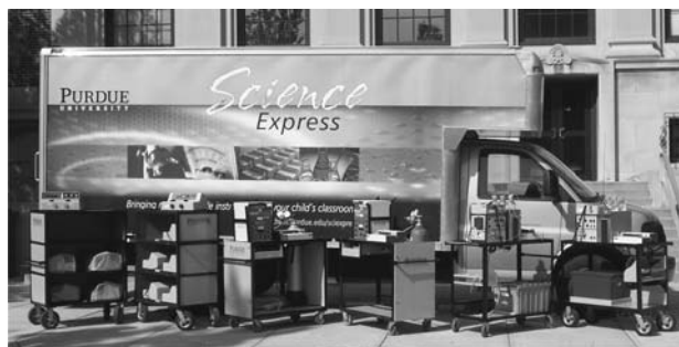
F1. Purdue's Science Express science van

A scientific instrument project at multiple sites throughout the State of Indiana has been proposed. This would educate high school science teachers in the use of modern instrument technologies for making scientific measurements and deliver first-class sets of scientific instruments to their schools for hands-on experimentation in the classroom. This is not a new idea. It has been well established for over 15 years in several states, including Indiana, where it was first prototyped at Purdue University, inspired by a program in Pennsylvania. (Ben Franklin would have loved the idea!) This is smart funding for school science, smart for business, and it can fire up the students. Not to have this is to short-change students. The more young people see modern science, the more they will want to participate. F1 illustrates the reality of this program at Purdue.